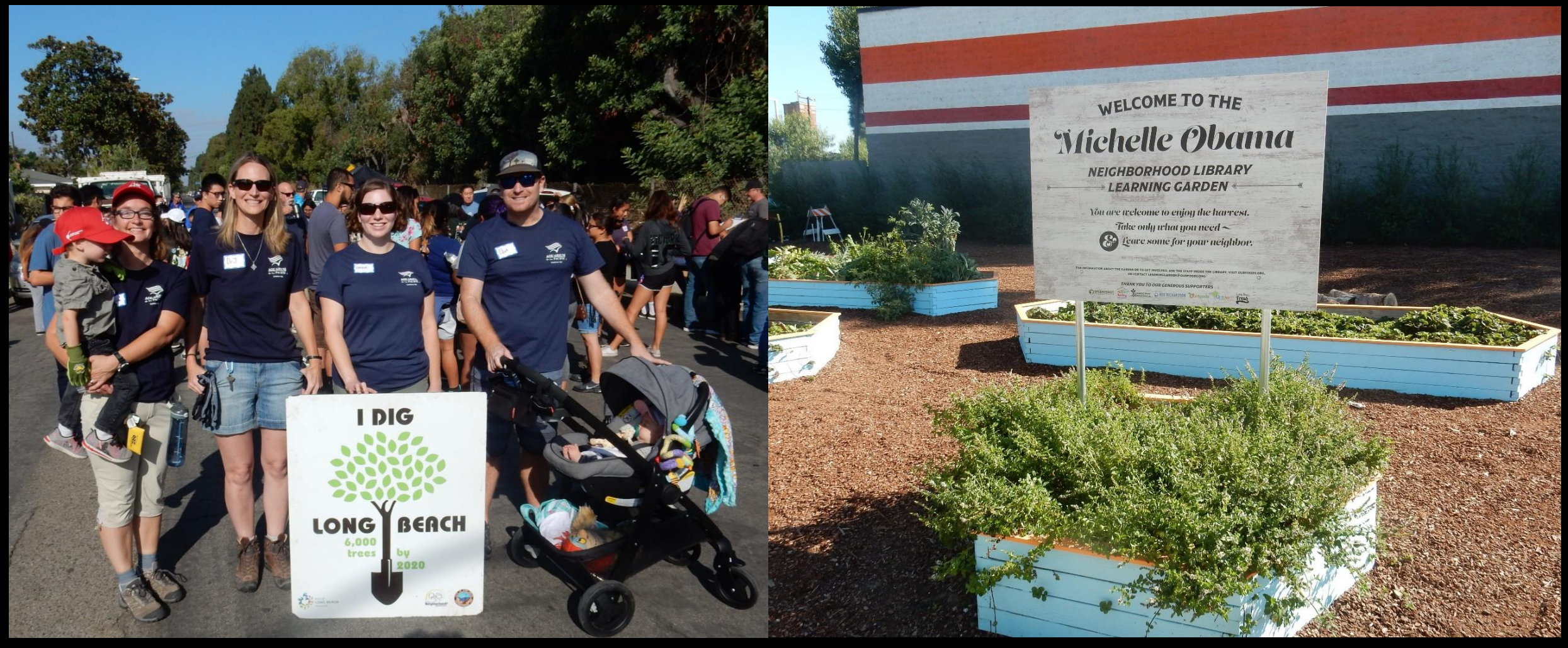
In the face of a changing environment, communities must be engaged and at the core of planning for the future